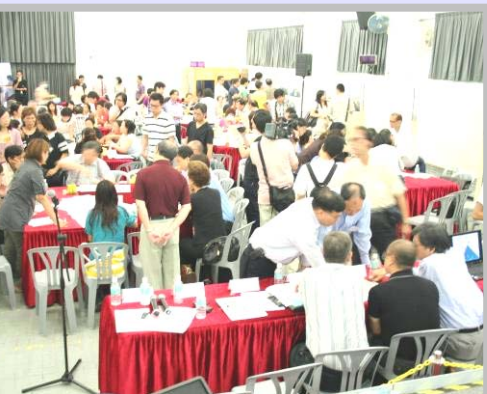
小組討論 Group Discussion