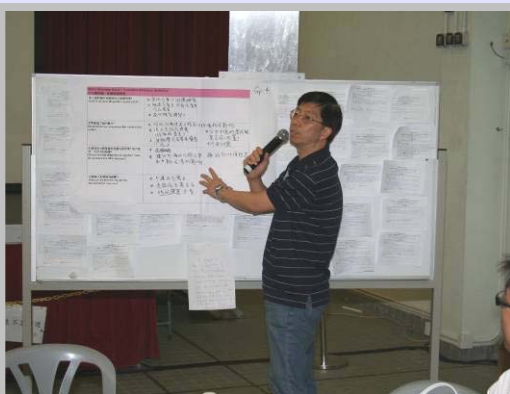
參加者匯報討論結果 Participants reported the group discussion result