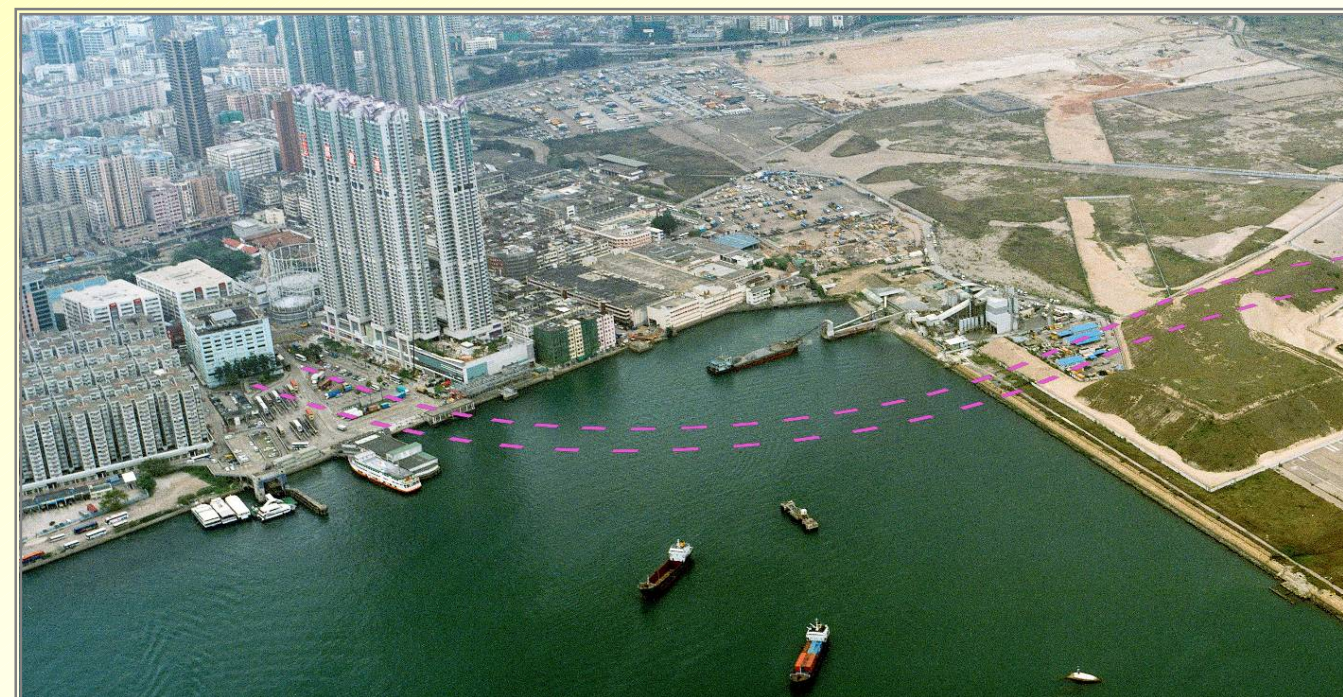
馬頭角至啓德的海底隧道 Underwater tunnel running from Ma Tau Kok to Kai Tak