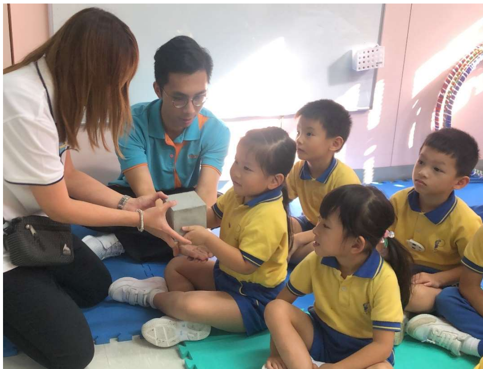
小朋友們透過觸摸混凝土，親身體驗其重量和質地。 Kids experienced the weight and texture of concrete.