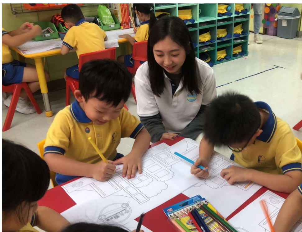
填色活動讓幼童發揮無限藝術潛能。 Colouring activities allow young children to show their artistic talents.