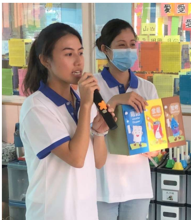
工程團隊分享「減廢、再用及循環再造」三個環保守則。 The project team shared the knowledge of 3R (Reduce, Reuse and Recycle) principles to the children.