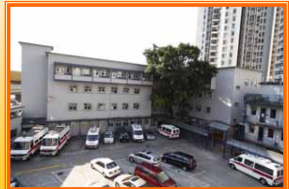
新翼 Annex Building