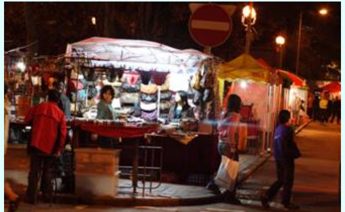
工藝品攤位 Distinctive Goods Stalls

我們在研究、設計及工程期間會繼續諮詢及保持與廟街代表的對話，以確保在工程施工期間及通車後，對廟街夜市的運作影響減至最少及維持廟街的連貫性。