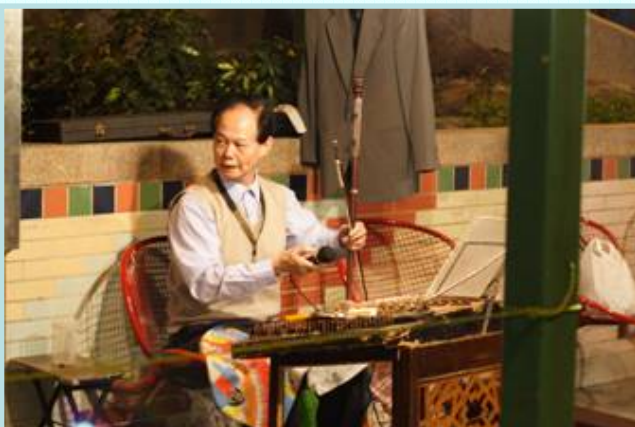
街頭粵曲表演 Chinese Street Opera

Temple Street can be found in the Kowloon Map as early as in 1887