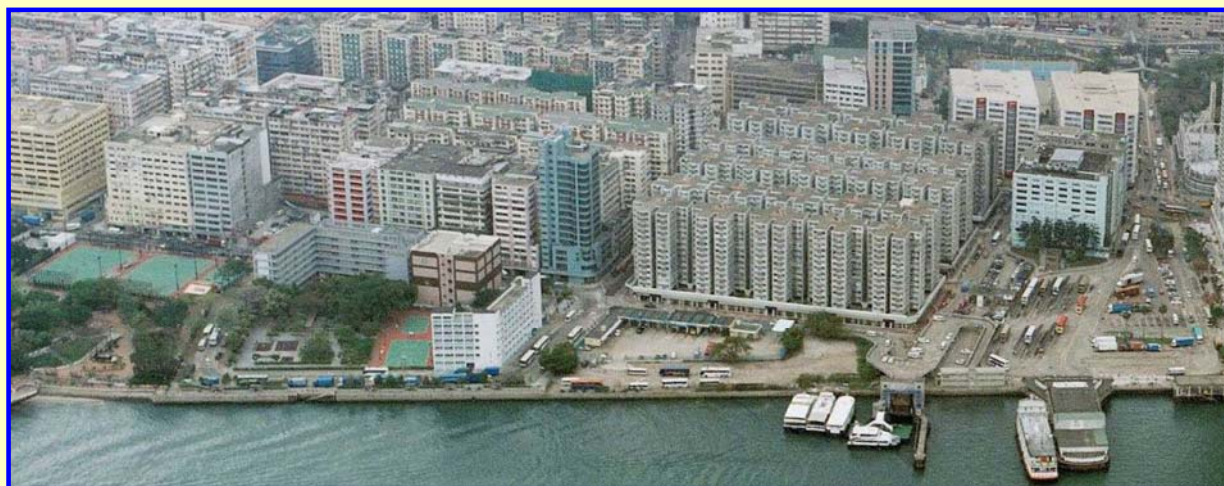
馬頭角地區 航攝照片 Ma Tau Kok Area –Aerial Photo