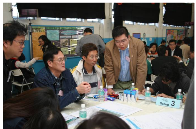
分組討論 Group Discussion