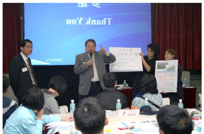
匯報分組討論結果 Reporting of Group Discussion Result