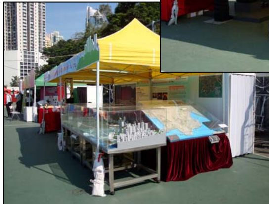
路政署攤位 Highways Department's Booth

香港天文台在2008年11月14至16日在銅鑼灣維多利亞公園舉辦了「科學為民」嘉年華2008，活動包括有展覽攤位、展示館、特別車輛、儀器展覽、工作坊和節目表演，目的是讓公眾輕鬆地透過參與有趣的文娛活動，增加了解政府多個局、部門及一些協作機構和大專院校等利用科技所提供的服務。路政署亦有參與此項活動，我們除介紹中九龍幹線工程外，並提供一些不同的行車隧道建造方法資料。