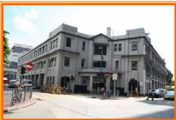
舊翼 Original Police Station Building

The Study will address physical form, accessibility, vibrancy, connectivity, view corridors, air circulation and local culture continuity of the project area. The Study will also tie-in with the Conservation Study and Built Heritage Impact Assessment to recommend compatible possible future use or adaptive re-use of the Police Station.