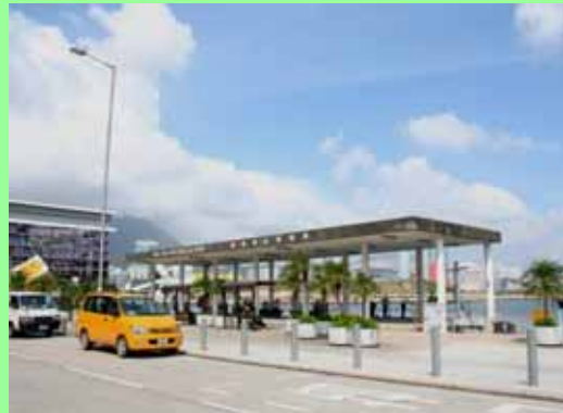
馬頭角公眾碼頭 Ma Tau Kok Public Pier