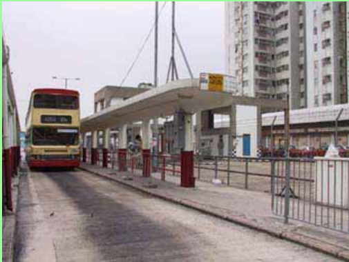
巴士總站 Bus Terminus