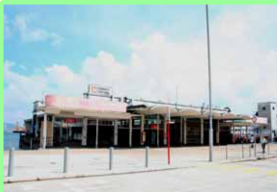
九龍城渡輪碼頭 Kowloon City Ferry Pier