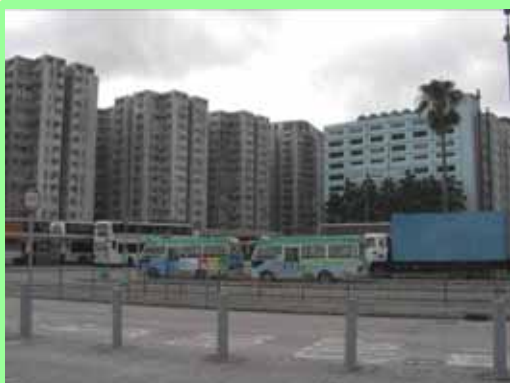
小巴士站 GMB Stop

At the East End of CKR, there will be a section of cut and cover tunnel in the area of San Ma Tau Street. Therefore, the existing public transport interchange at San Ma Tau Street and the public and ferry piers in the vicinity will be affected during the construction stage. To maintain the public services and minimize the impacts to the residents, we are investigating the associated temporary reprovisioning arrangement.